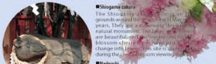
Shiwahiko Shrine The Shiwahiko Shrine grounds are 1,000 years old. They are a nationally designated natural monument. The shrine is a beautiful and colorful shrine with a blossoms when the cherry blossoms change into leaves. This site is also during the cherry blossom viewing.

Shiogama Shrine Museum The Shiogama Shrine has about 5000 artifacts on display, including treasures that are part of its storied history. The portable shrines carried during festivals and many cultural assets can be seen here, including articles celebrated for salt-making and fishing, which have deep associations with the environment. ♫ Adults 200 yen / middle and high school students 150 yen / Elementary school students 80 yen (discounts for groups of over 20) ● Apr to Sep 8:30 to 17:00 / Feb, Mar, Oct, and Nov 8:30 to 16:30 / Jan and Dec 8:30 to 16:00 ♪ No holidays