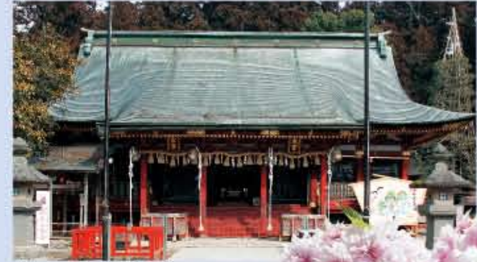
Shiogama Shrine [MAP B-3] 1-1 Ichimoriyama, Shiogama-shi ☎ 022-367-1611 ● Grounds 5:00 to 20:00 ♪ No entrance fee

This is the guardian of Tohoku and the most important Oshu shrine with a history of over 1200 years, having been worshipped at since ancient times in order to pray to the gods for successful fishing, safety on the sea, and safe childbirth. The honden and haiden have been designated important national cultural assets. The Shiwahiko Shrine, also on the same land of Ichimoriyama, has a different appearance. The main building is vividly colored, with black lacquer on the honden and red lacquer on the haiden. You can see the islands in Matsushima Bay from the grounds.